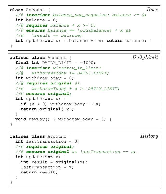
Figure 3: In explicit contract refinement, contracts can be defined for methods and method refinements; contracts for method refinements can refer to the original precondition or postcondition.

In feature DailyLimit , we slightly changed the implementation of method update compared to Figure 1. The reason is that contracts help to avoid defensive programming.<sup>2</sup> In this example, we formulated a precondition requiring callers