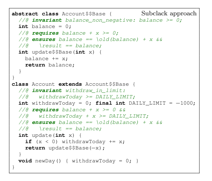
Figure 5: Composition of features Base and DailyLimit with the Subclack approach.

In Figure 5, we illustrate the Subclack approach using our running example. The result of composing the features Base and DailyLimit is similar to the result of the Subclassing approach. The subtle difference is that method update from feature Base is renamed into update$$Base. Because the method has a different name than its refinement in class Account, specification inheritance does not apply to this method. Consequently, we can add a method contract to method update$$Base, which need not to be established before and after a call to method update. Instead, the added contract for method update$$Base needs to be fulfilled only when the method refinement of feature DailyLimit calls the method as defined in feature Base. Hence, we establish a behavioral interface between the features DailyLimit and Base. If feature DailuLimit does not fulfill the precondition of method update$$Base, we assign blame to feature DailyLimit. Similarly, if feature Base does not fulfill the postcondition, we identify feature Base as faulty.