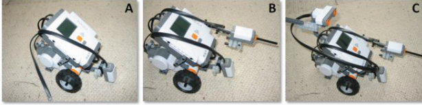
Figure 9. Three different variants of the robot

In Figure 9, configuration A shows the robot in its basic setup ( bumper = false and sonar = false ), B shows the configuration with the bumper and C shows bumper and sonar.