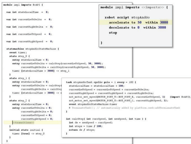
Figure 13. A simple robot script (top right, grey) and the lower level MEL program it is transformed into